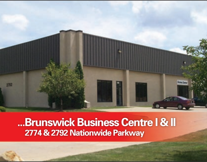
...Brunswick Business Centre I & II 2774 & 2792 Nationwide Parkway