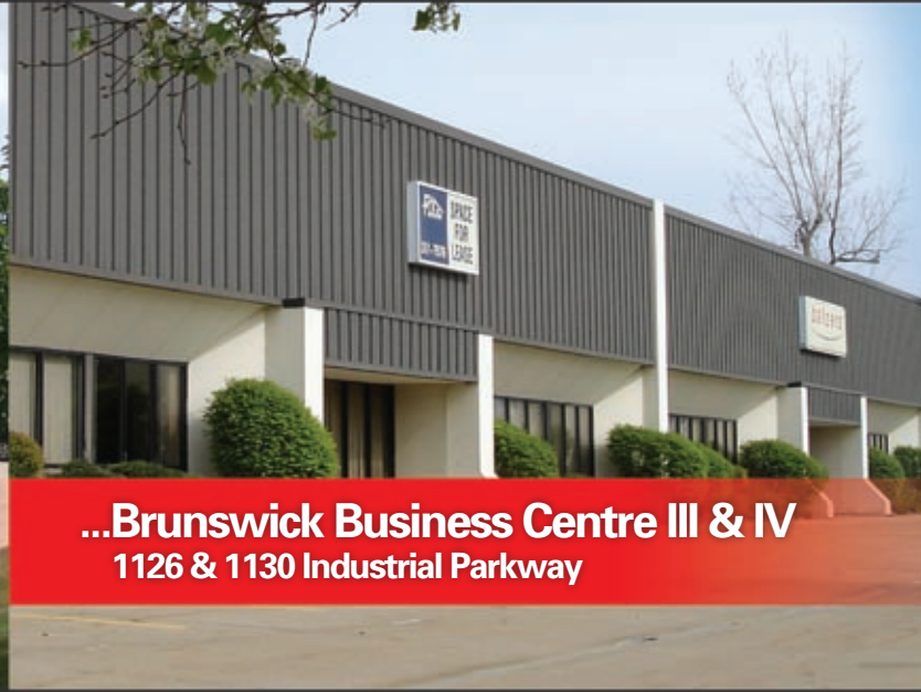
...Brunswick Business Centre III & IV 1126 & 1130 Industrial Parkway

“Flexible Spaces in All the Right Places” is what Fogg had in mind when designing their large portfolio of office, industrial and office/warehouse (flex) properties. Strategically located near major freeways in northeast Ohio, Fogg’s properties offer flexible floor plans, truck access and lease terms, as well as expansion opportunities for their growing customers.