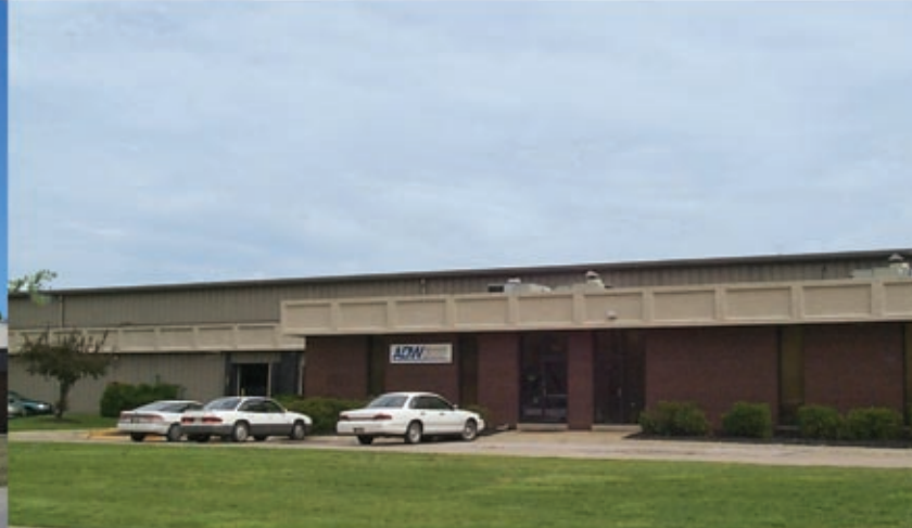
...Centax II 900-998 Valley Belt Rd., Brooklyn Heights, Ohio

“Flexible Spaces in All the Right Places” is what Fogg had in mind when designing their large portfolio of office, industrial and office/warehouse (flex) properties. Strategically located near major freeways in northeast Ohio, Fogg’s properties offer flexible floor plans, truck access and lease terms, as well as expansion opportunities for their growing customers.