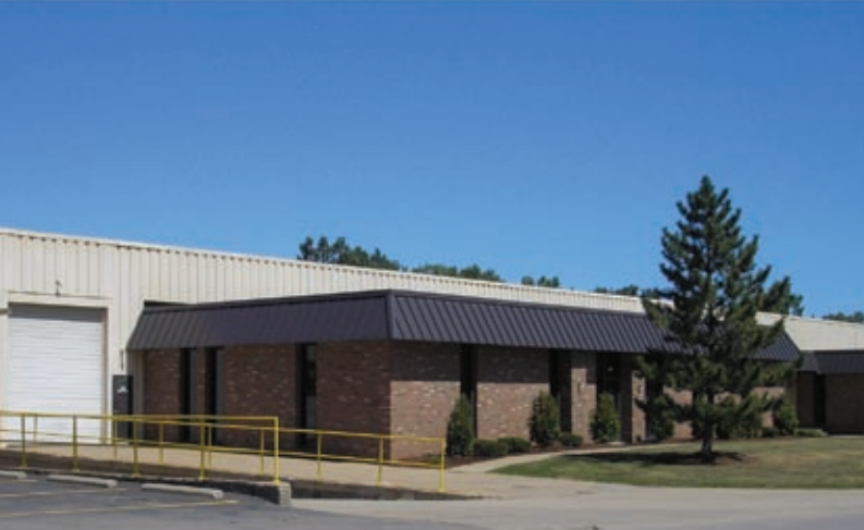
...Centax I 1000-1020 Valley Belt Rd., Brooklyn Heights, Ohio