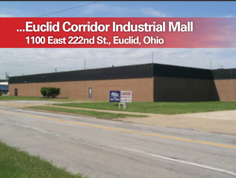
...Euclid Corridor Industrial Mall 1100 East 222nd St., Euclid, Ohio