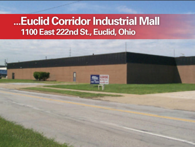
...Euclid Corridor Industrial Mall 1100 East 222nd St., Euclid, Ohio