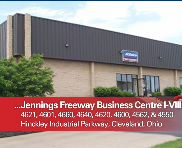
...Jennings Freeway Business Centre I-VIII 4621, 4601, 4660, 4640, 4620, 4600, 4562, & 4550 Hinckley Industrial Parkway, Cleveland, Ohio