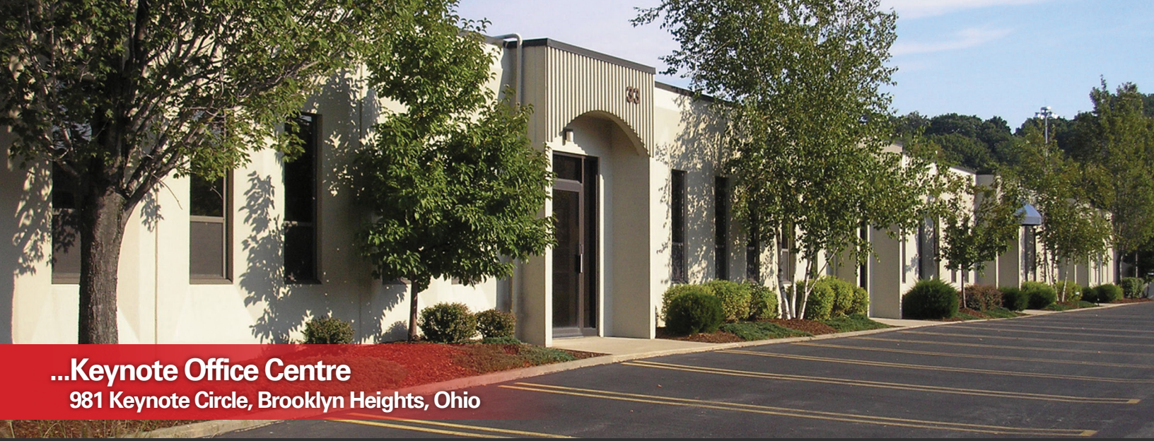
...Keynote Office Centre 981 Keynote Circle, Brooklyn Heights, Ohio

“Flexible Spaces in All the Right Places” is what Fogg had in mind when designing their large portfolio of office, industrial and office/warehouse (flex) properties. Strategically located near major freeways in northeast Ohio, Fogg’s properties offer flexible floor plans, truck access and lease terms, as well as expansion opportunities for their growing customers.