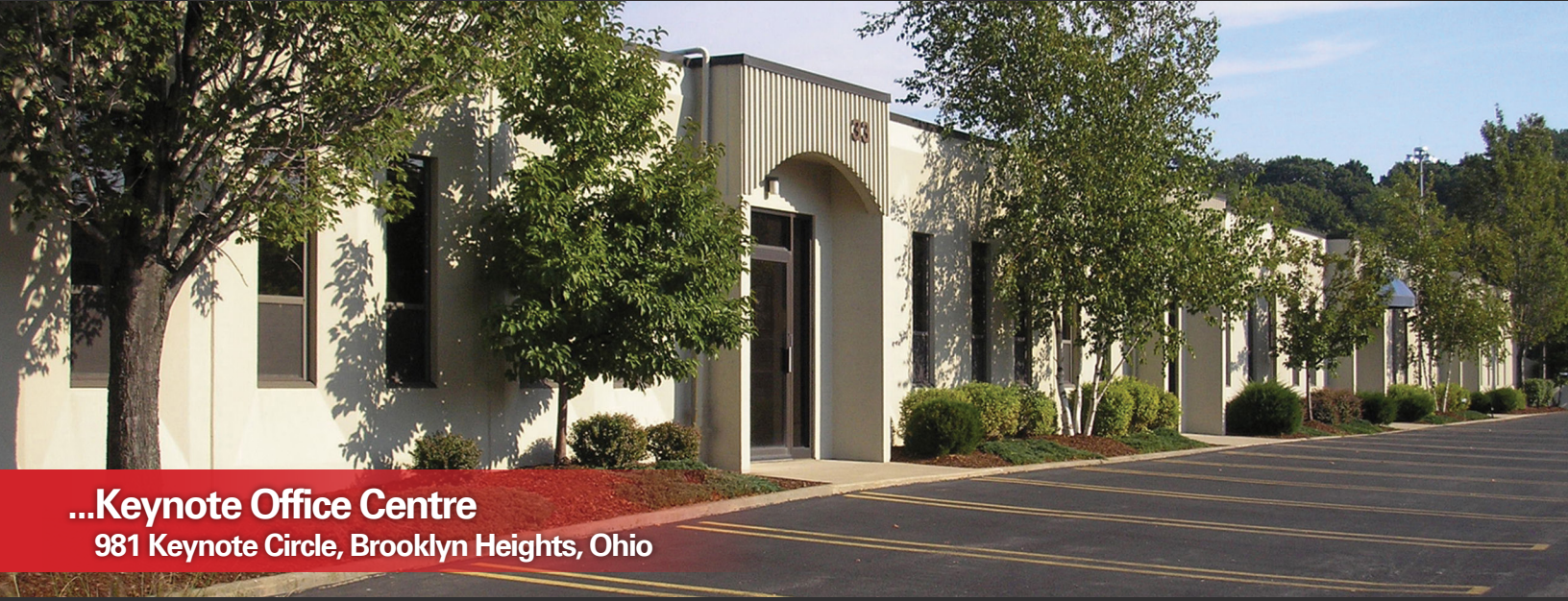
...Keynote Office Centre 981 Keynote Circle, Brooklyn Heights, Ohio

“Flexible Spaces in All the Right Places” is what Fogg had in mind when designing their large portfolio of office, industrial and office/warehouse (flex) properties. Strategically located near major freeways in northeast Ohio, Fogg’s properties offer flexible floor plans, truck access and lease terms, as well as expansion opportunities for their growing customers.