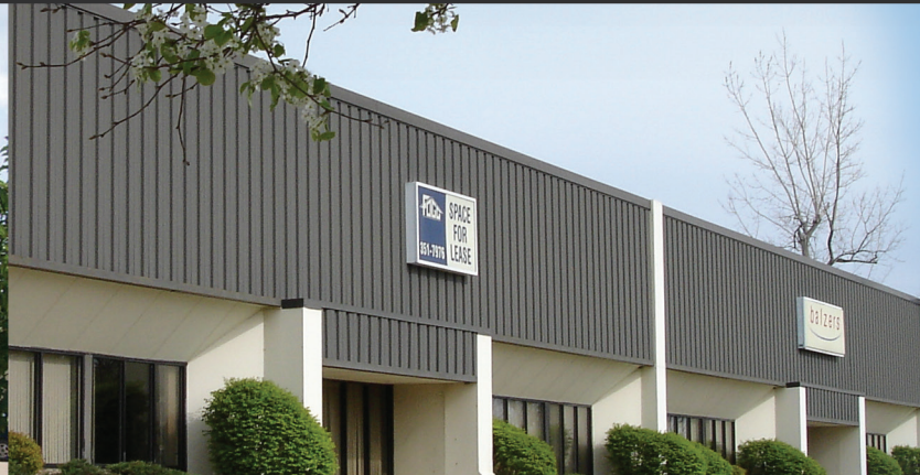
...Brunswick Business Centre III & IV 1126 & 1130 Industrial Parkway

“Flexible Spaces in All the Right Places” is what Fogg had in mind when designing their large portfolio of office, industrial and office/warehouse (flex) properties. Strategically located near major freeways in northeast Ohio, Fogg’s properties offer flexible floor plans, truck access and lease terms, as well as expansion opportunities for their growing customers.