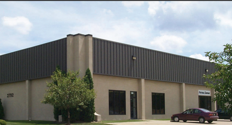
...Brunswick Business Centre I & II 2774 & 2792 Nationwide Parkway